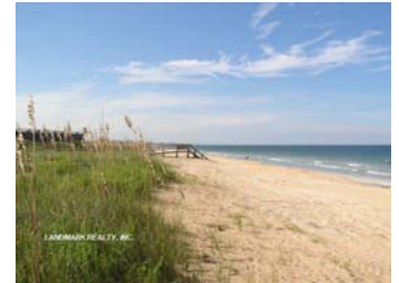
In April 2007, the DHS Marching Band plans on attending a music festival on the Gulf Coast

The DHS Marching Band is planning on attending a music festival on the gulf coast in April 2007 as part of a year end band trip. Fun in the sun, competitive performances, and great times will be had by all who attend. More to come, stay tuned!